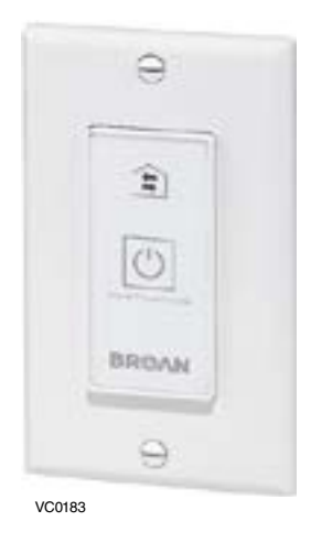
VB20W Part no. VB20W

NOTE: Push button appearance may slightly vary.