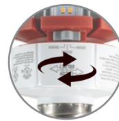
Color Select Switch