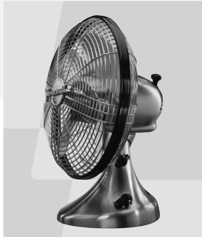
Versatile Style The Swan's Deco-period style is at home in any room and in any decor, and is an attractive alternative to ordinary oscillators.