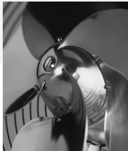
Deep-Pitch Paddles The overlapping elephant-ear paddles replicate those of the original 1934 Silver Swan fan. Their deep pitch takes a big bite of air and moves it efficiently and quietly.