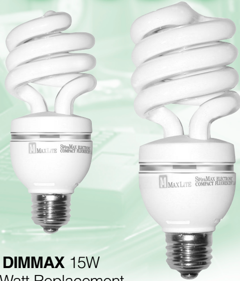
DIMMAX 15W 60 Watt Replacement