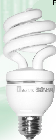
DIMMAX 20W 75 Watt Replacement